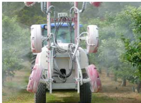
Du-Wett enhances spreading and foliage deposition.