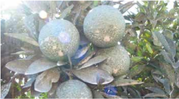
Surround applied in 2000 L water/ha (no adjuvant)