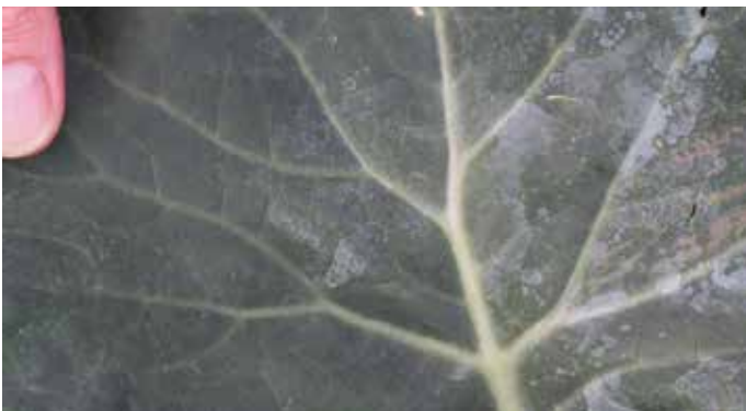
Without Du-Wett - deposition patchy